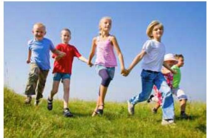
Every child matters!