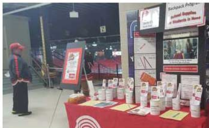
Bear Wheel & Brake #RedRising Owen Sound Attack Coin Can Challenge Kick-Off night.