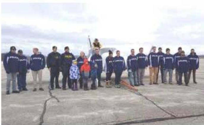
1st Annual OPP - Western Region Pull-A-Plane Event in support of United Way Community Programming.