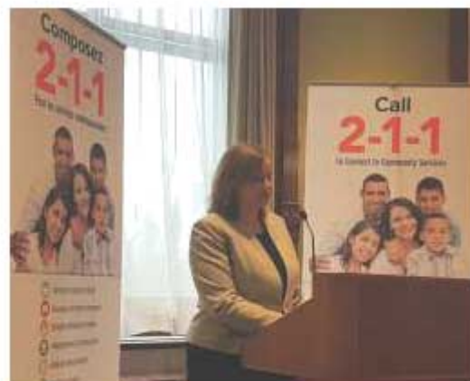
211 Day - Queen's Park.

Governed by a local Board of Directors, along with other volunteers, our donors and staff, we help to build caring communities and respond to a broad range of local unmet human needs.