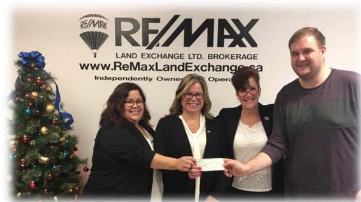
Remax Land Exchange LTD. Hope for Our Kids Donation

And, I would like to thank all of our donors, both individuals and organizations, for being so generous