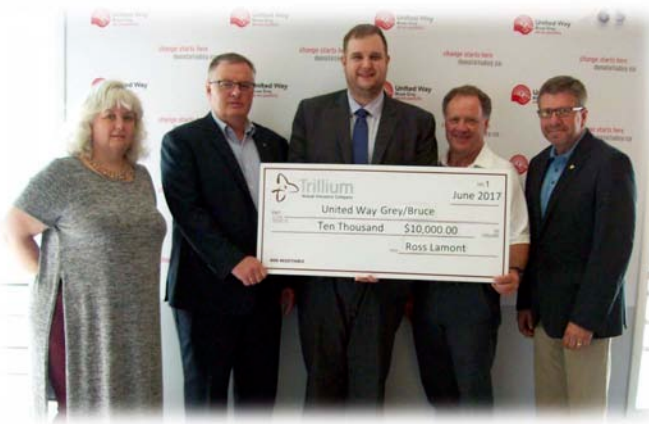
Trillium Mutual Insurance Company $10,000 Donation