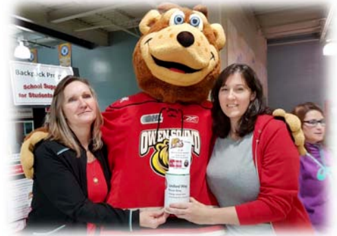
Attack "Away Game Goal" Campaign in support of the Backpack Program

Governed by a local Board of Directors along with other volunteers and staff, we help to build caring communities and respond to a