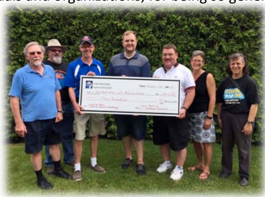
Grey Bruce Labour Council Backpack Donation