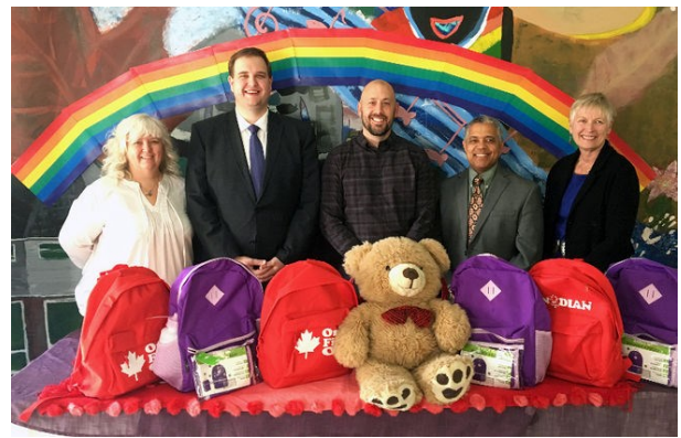
Hope for Our Kids—Partnership with BGCFS

Late 2017 also saw the expansion of the United Way's