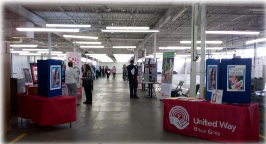
Hobart Food Equipment Partner Agency Trade Show