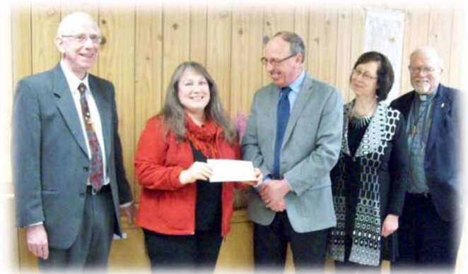
Bruce United Church Co-Operative Curl for Relief Bonspiel Donation